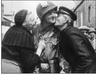
An American soldier is given a warm welcome after the town of Saint-Sauveur-Le-Vicomte was liberated.

Hear their stories. Learn their names. Stand where history was made.