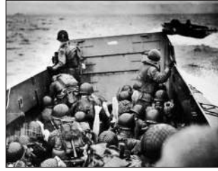
D-Day Landings on Omaha Beach