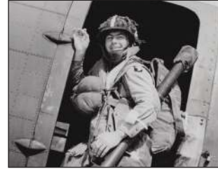
Paratrooper of the 101st Airborne Division prior to D-Day.