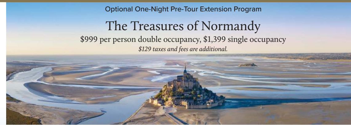
Aerial view of Mont Saint-Michel

Optional One-Night Pre-Tour Extension Program