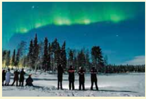
Northern Lights Village | Pyhä